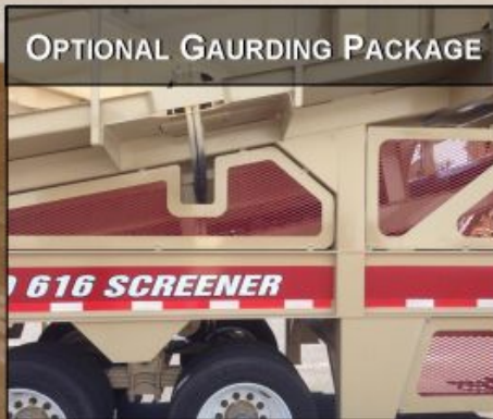
OPTIONAL GAARDING PACKAGE